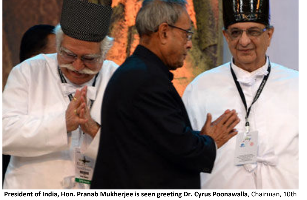
World Congress in Mumbai on Friday, 27th December 2013.

The government of India, in its Also present at the four-day 12th five-year plan envisages event, being held at the National several measures to protect Sports Club of India, Worli, were governor K Sankaranarayanan and state rural development